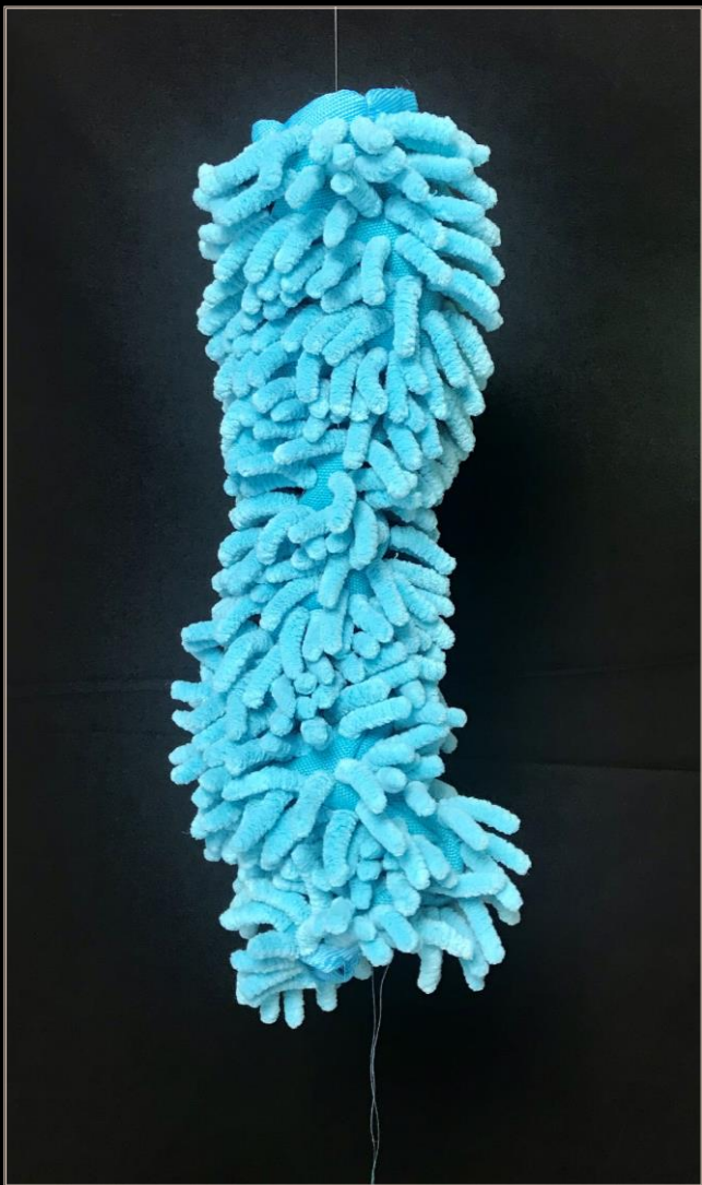
Turquoise fauna, 2021 Microfibre 120 x 1300 mm