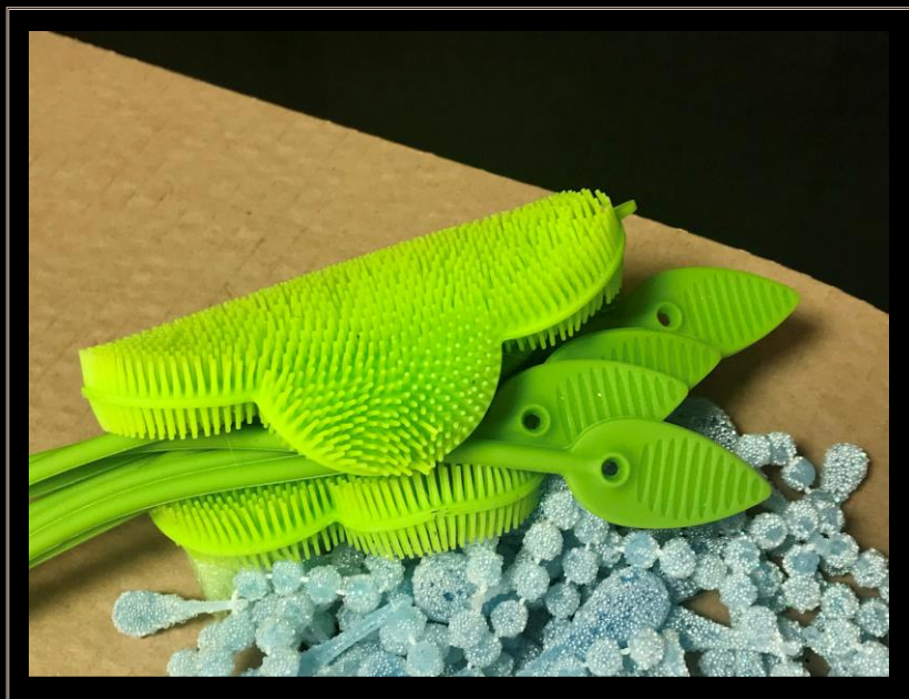
Green fauna and flora, 2021 Miscellaneous silicone and plastic-ware 220 x 80 mm