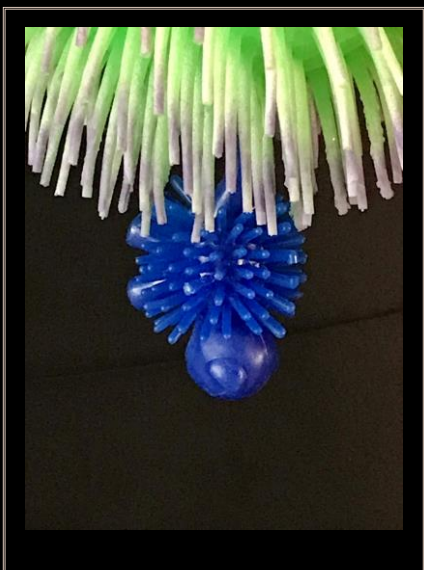
Green and blue fauna, 2021 Silicone and plastic toys 150 x 180 mm