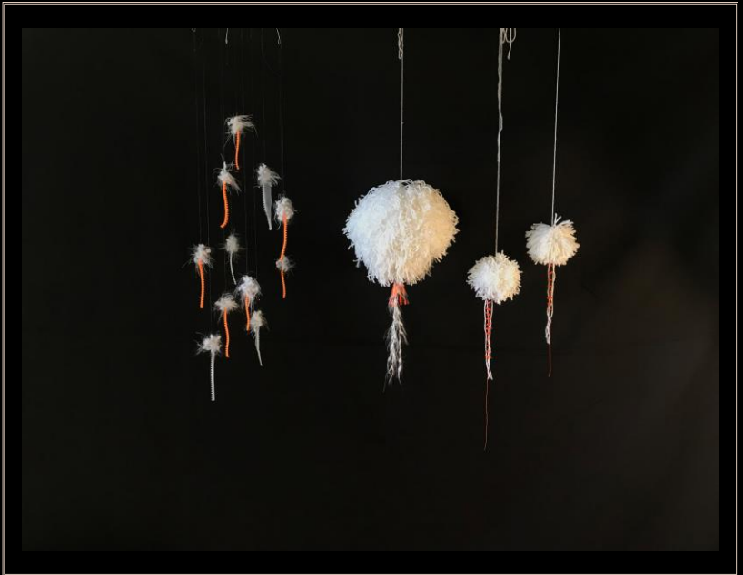
Deep Sea Creatures, 2020 Synthetic baby wool, plastic zippers, safety tape 300 x 150 mm