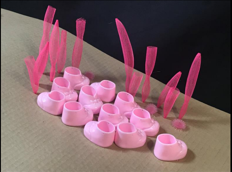
Pink fauna and flora, 2021 Plastic party-ware 300 x 150 mm