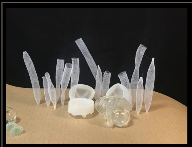
White flora and fauna, 2021 Miscellaneous plastic-ware 260 x 180 mm